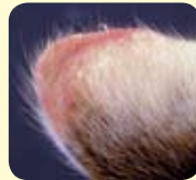
Ear tip of a cat showing cancerous changes