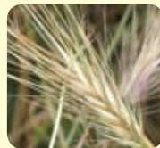
Grass awns of the summer grasses