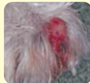
Paw of a dog with an interdigital cyst caused by a grass seed